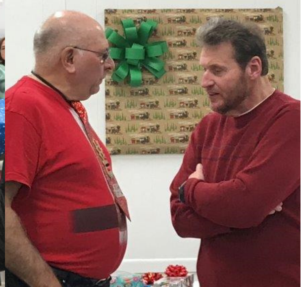
All Pictures from the Christmas Party are available to view in the Photo Gallery on our website at www.wnycc.com .